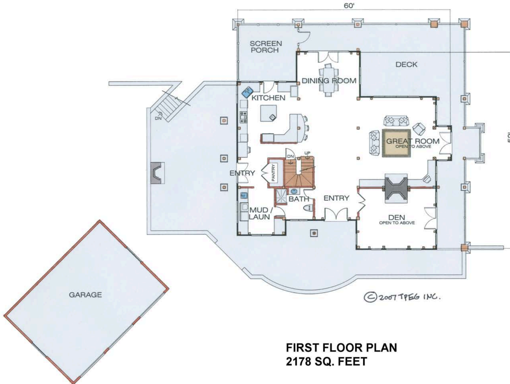
FIRST FLOOR PLAN 2178 SQ. FEET

To learn more about this plan, click here to contact us.