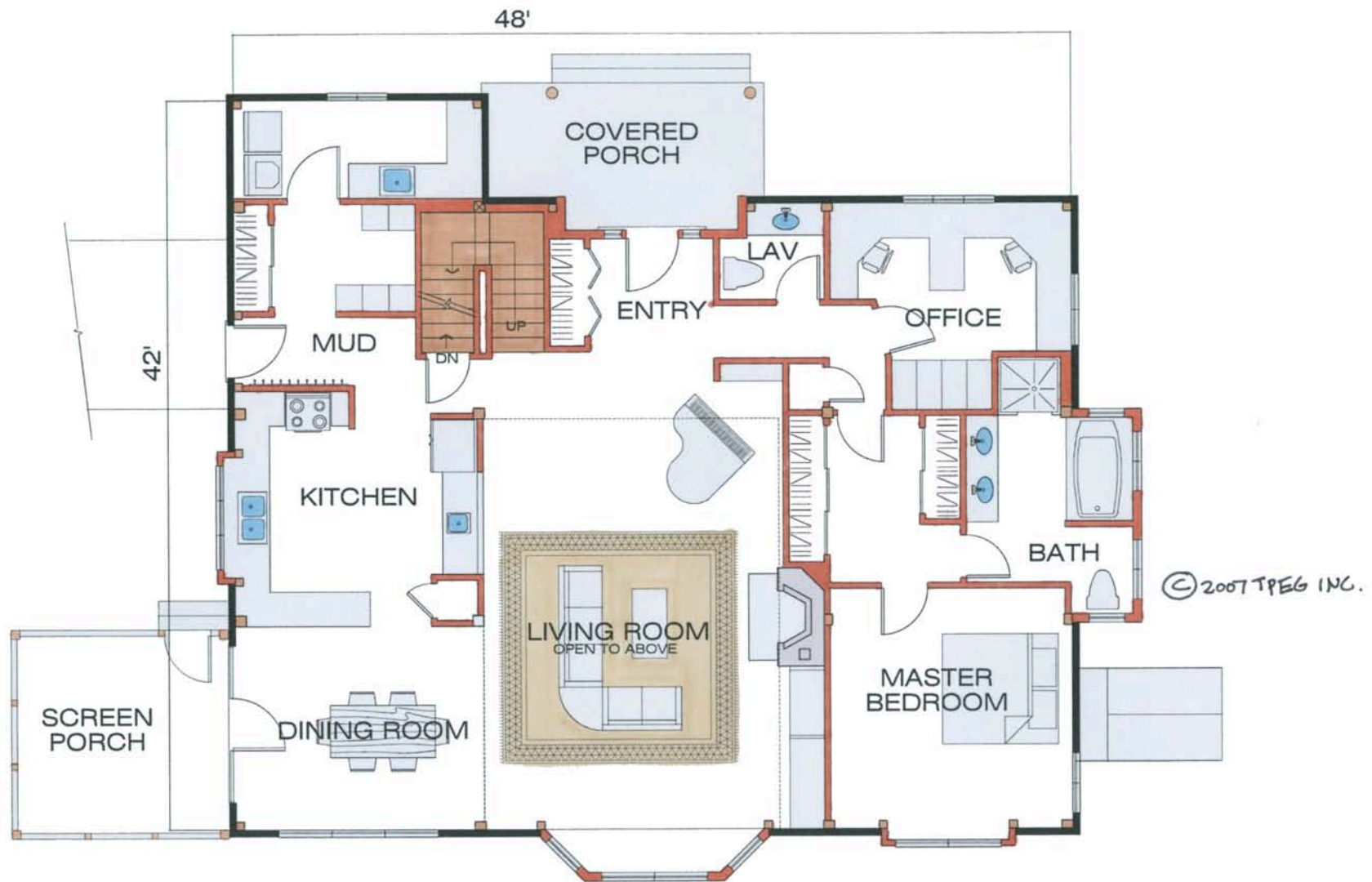
FIRST FLOOR PLAN 1861 SQ. FEET

To learn more about this plan, click here to contact us.