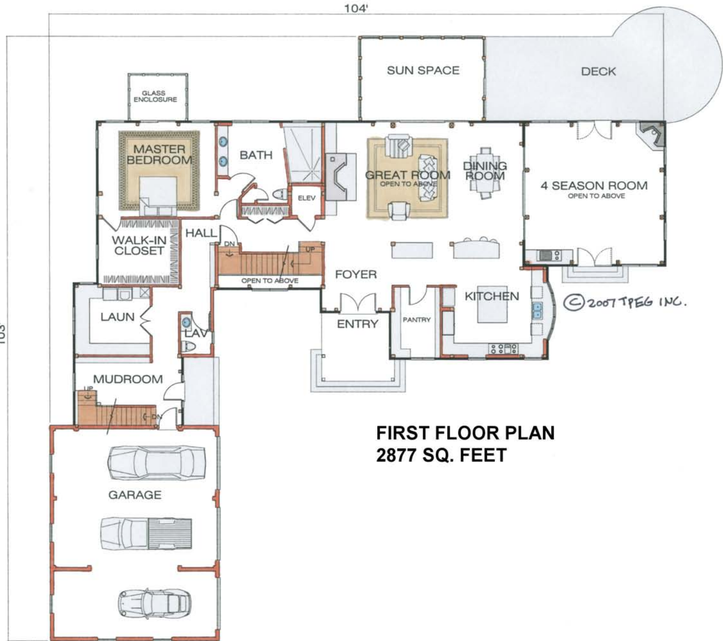
FIRST FLOOR PLAN 2877 SQ. FEET

To learn more about this plan, click here to contact us.