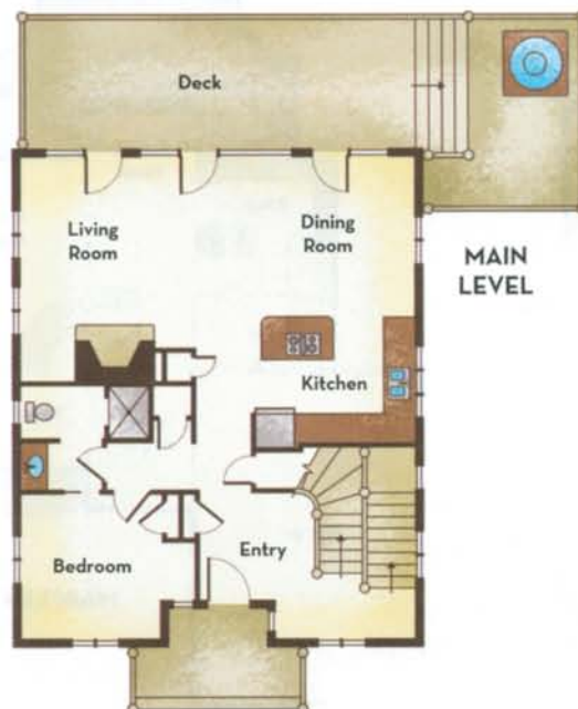
Hawk Mountain • 1,627 square feet